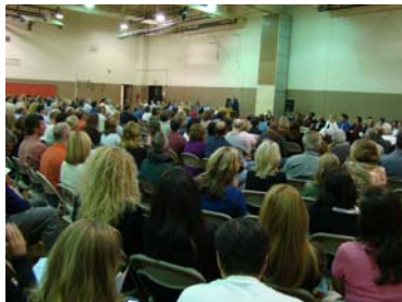
Back-to-School Night General Session

This year, we held Back-to-School Night on September 25 utilizing a new format which emphasized the importance of PLCs and Teaching Teams to our new school schedule. Parents had the opportunity to attend a general meeting in the gym before hearing a team presentation and having an opportunity to meet the teachers. The evening ended with grade level sessions to learn about our elective/exploratory program given by special subject area teachers. This new format decreased the amount of time parents spent moving from class to class and increased the amount of time devoted to learning about our programs and meeting our teachers.