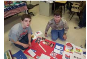
Preparing campaign banners