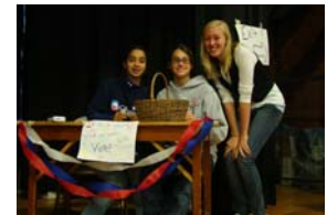
Registering student voters