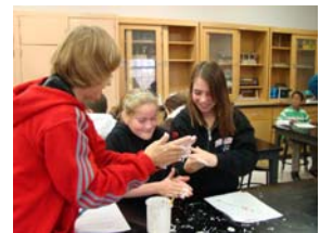
"What is this stuff?"