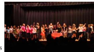
Drama Club takes final bows!

On Friday, November 21, members of the PV School Drama Club presented their annual Fall Drama Showcase. The performance featured a variety of acts including singing, dancing, and acting. Students were primarily responsible for preparing their own material. The club prepared and produced several ensemble numbers which showed their acting skills. These included a mimed restaurant scene set to Beethoven's Fifth, a Monty Python inspired skit on one-upmanship, and a scene where inanimate objects gained the ability to talk. Congrats to our student performers and their directors!