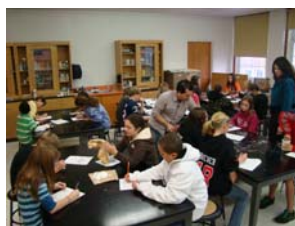
Grade 6 Science Lab