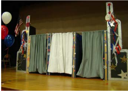
School Voting Booths on stage